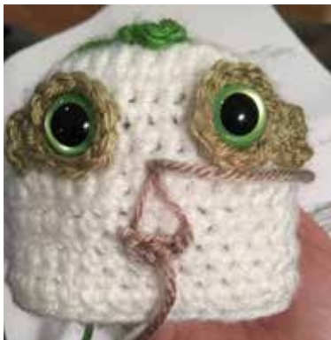
Sew loops around top part of beak