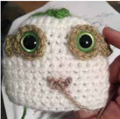
Attach bottom beak