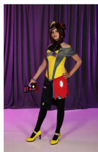
Fruit Chompin' and Show Stoppin'