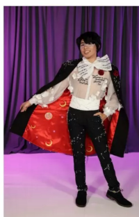
Love and Serenity Sailor Moon