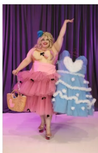
Out of the Box Barbie