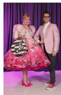
Made for This 65 Years of Barbie